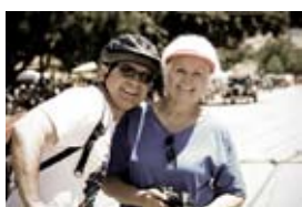
by Noella Vigeant