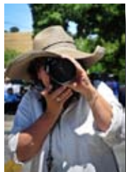
by Sue Brazelton

Our first Moment in Time shoot-out was held at High Noon on July 4th. Members took one photo wherever they were at the moment and posted it on the Flickr shoot-out site.