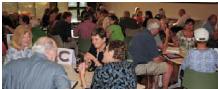
A room full of photographers